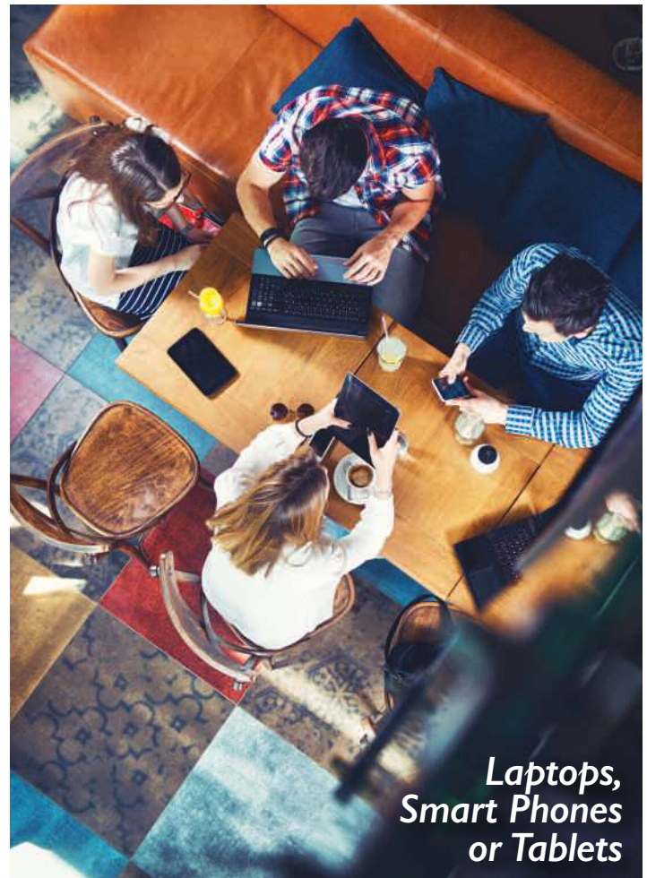
Laptops, Smart Phones or Tablets