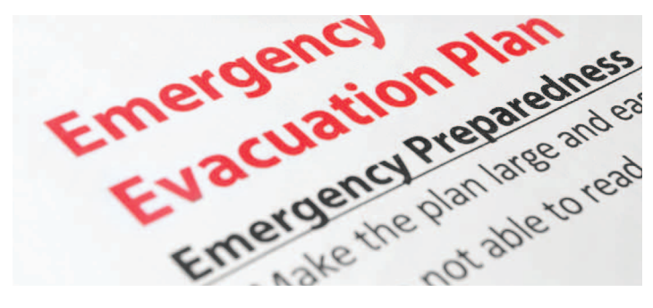
EMERGENCY CODES PREVENTION & PREPAREDNESS

An evacuation plan is posted in each classroom/lab and drills are held throughout the year. For maximum safety/security, each campus employs local law enforcement officers/deputies, security specialists/monitors and uses 24-hour camera surveillance.